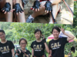
One for the album, obstacles course done!