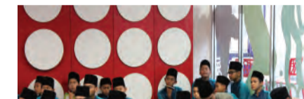
Blessing and Prayers in progress