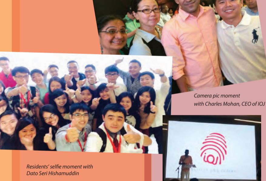
Residents' selfie moment with Dato Seri Hishammuddin

On 7th of September, THM residents attended the official launch of Institute Onn Ja'afar, a newly formed NGO under the patronage of Dato Seri Hishammuddin. The heartfelt messages from the CEO to Dato Seri indeed were an inspiration that we were on the right path introducing a service learning journey to our youth. IOJ's mission to help the poor and vulnerable regardless of race and religious background with a focus to provide humanitarian aid, medical services, free lessons to children through the help of a band of multiracial volunteers globally, beginning in Malaysia.