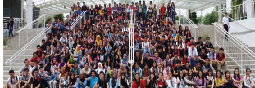
Our new 'family' from 5 different locations

A total of 393 residents from 5 locations namely Rajawali, Puncak Prima, U-Residence, My Place and Pangsapuri attended their first brief prepping them for their Service Learning journey here. Participants were engaged and actively contributed their ideas resulting in a lively session. Outcomes included the formation of 5 groups challenged to come up with their unique interactive community engagement program.