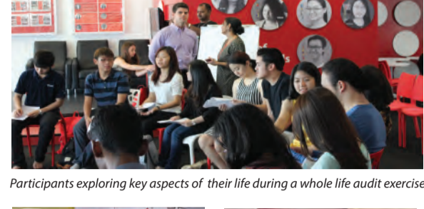
Participants exploring key aspects of their life during a whole life audit exercise