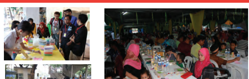
Residents of PPR Seri Pantai enjoying their VIP treatment

THM co-hosted a Buka Puasa treat to an urban poor community as a means of crossing the cultural divide between our residents and community at Project Perumahan Rakyat (PPR) Seri Pantai. The guests, young and old were treated to a VIP experience, served personally by our students during the 'buka puasa'. For the children there were ample fun and games bringing fun and joy to all. From flyer distribution a week before, to preparation for the day and ultimately serving them, our residents came back full of warmth from the expressions of gratitude they received. A job well done on this successful interactive festive celebration.