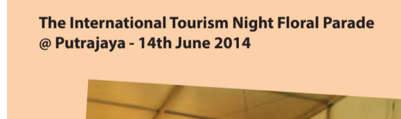
Exciting, colourful exhibition brings life to Putrajaya