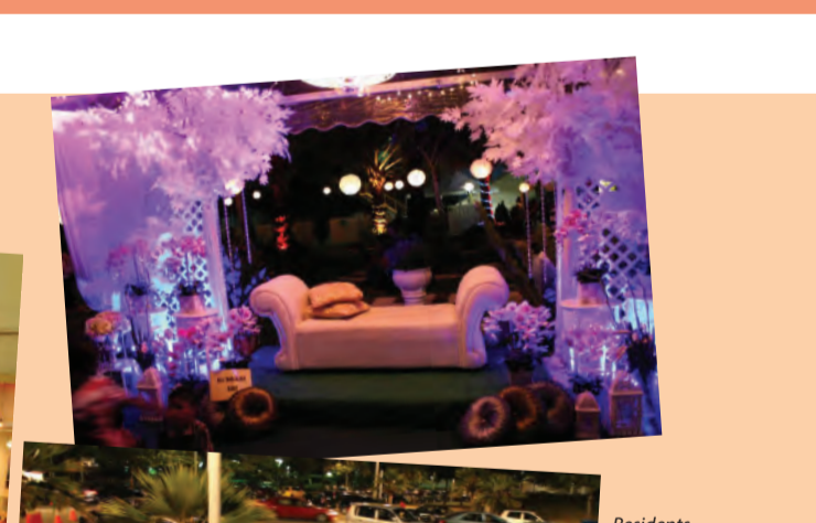
Residents experiencing the delights of the floral parade...