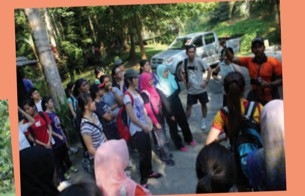
Instructor briefing on the do's and don't's