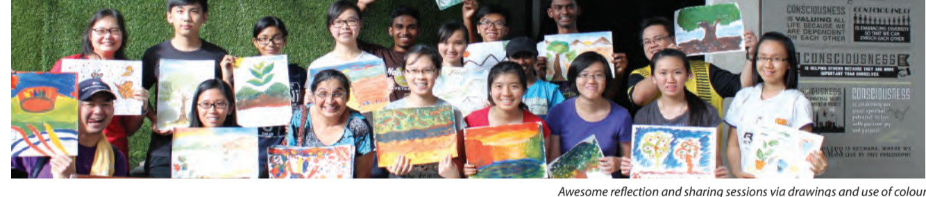
Awesome reflection and sharing sessions via drawings and use of colour

A Kechara Forest Retreat inspired vision to create an authentic holistic lifestyle center where urban folks can go for a get away from the hustle and bustle of hectic city life. We at THM, took our Service Leaders for an opportunity to engage in inviting, fun and wholesome-living nature program. Residents submerged themselves in the energy of rejuvenation and creation through "plant-ing" seeds of their goals and dreams, creating a new tempo and direction to their wholesome living.